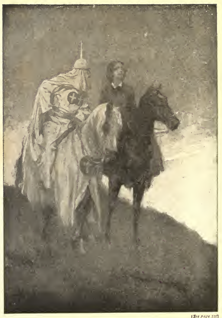
"'Do you not fear my betrayal of your secret?'" [See page 335]